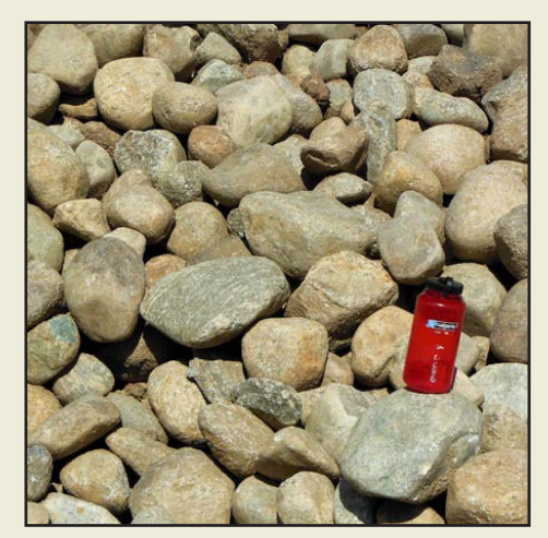
4"+ cobble/ river rock