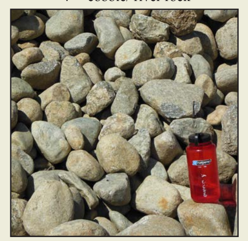
3-6" cobble/ river rock