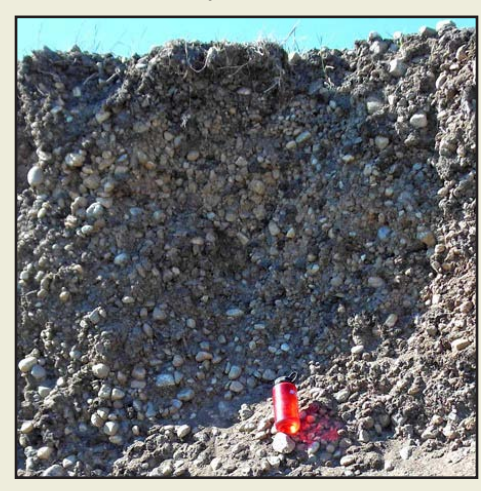
reject from topsoil screening