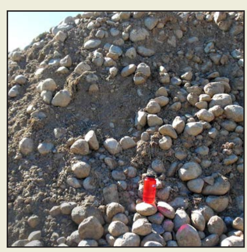
dirty rock/ fill