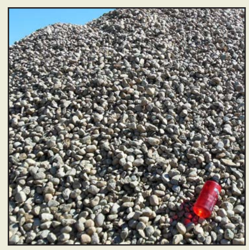
2" cobble/ river rock