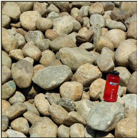
4"+ cobble/ river rock