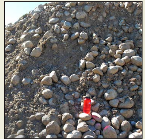
dirty rock/ fill