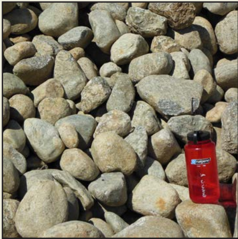
3-6" cobble/ river rock