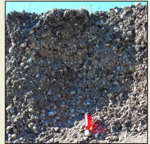
reject from topsoil screening